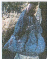
Made in USA

Lightweight poly mesh laundry bag is great for wet items like bathing suits. (approx 24" x 36") Item # BLM1 - $8.00